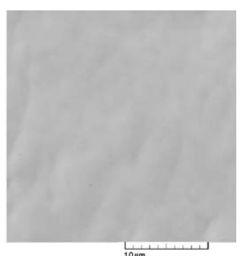
Typical "Cauliflower" effect