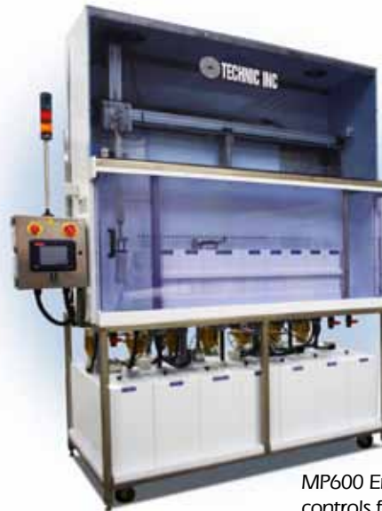
MP600 Enclosed hoist system with controls for multiple process support and data logging