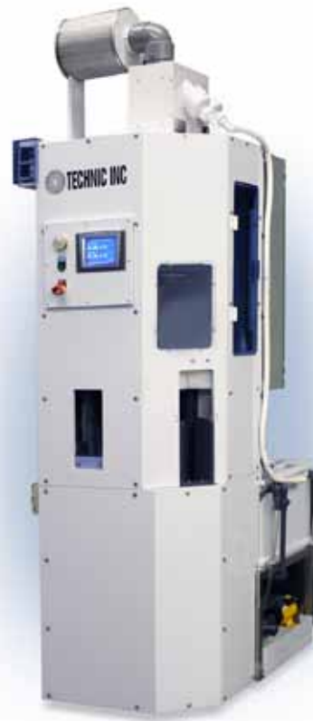
MP500 Automated Radial Style processing

MP300 systems adapt well to high production situations where part-to-part variation needs to be kept to a minimum and full automation is important.