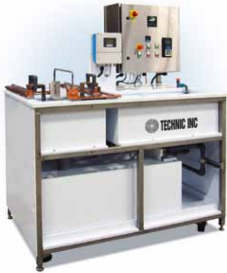
Technic Chemical Bench for Electropolishing

Chemical Benches are valuable resources for developing methods and producing larger parts on a smaller scale. Compact, customized configurations make them ideal for many developing and midlevel production applications.