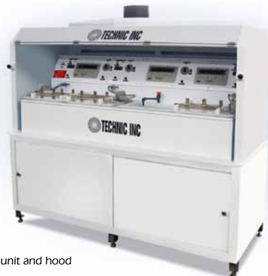
Mini-Plant with storage unit and hood

Technic's Mini-Plants offer table top convenience, quick delivery and simplified installation. They are ideally suited for laboratory, developmental and low level production applications where the parts are small. The completely self-contained systems are offered in standard single and multiple process configurations. All Mini-Plants may be customized with a number of optional features.