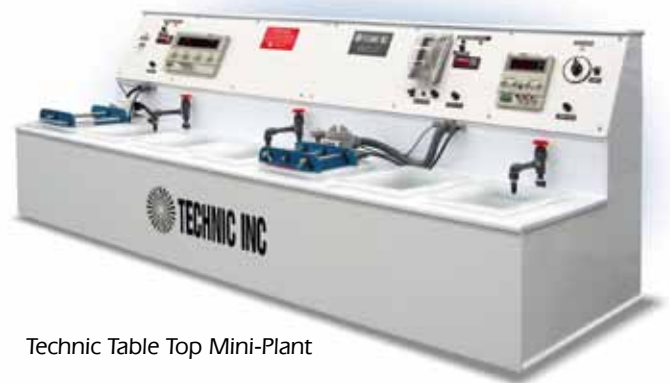
Technic Table Top Mini-Plant

Technic's Mini-Plants offer table top convenience, quick delivery and simplified installation. They are ideally suited for laboratory, developmental and low level production applications where the parts are small. The completely self-contained systems are offered in standard single and multiple process configurations. All Mini-Plants may be customized with a number of optional features.