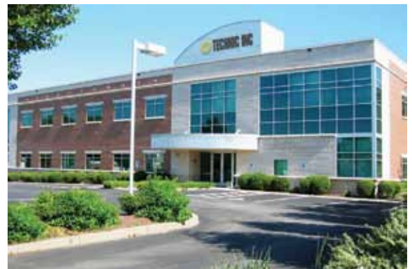
Technic Corporate Headquarters, Cranston, RI USA

Technic currently operates over 20 global facilities in 14 countries within North America, Asia, and Europe. Our Advanced Engineered Solutions approach to customer projects allows Technic to add substantial and differentiated value to the markets and customers we serve. We look forward to helping you realize the maximum potential from your new product development goals.