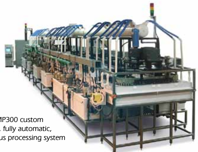
Technic MP300 custom designed, fully automatic, continuous processing system