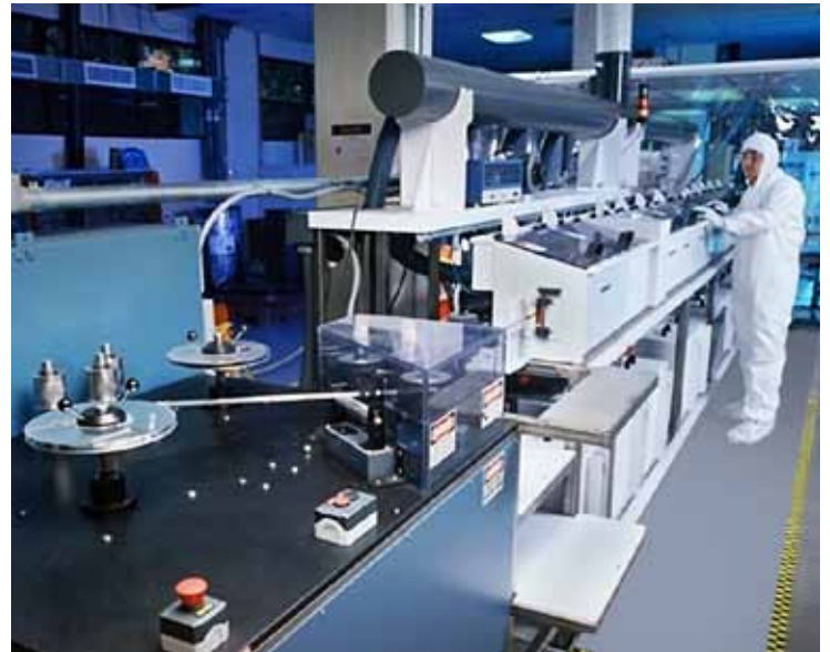
Reel to reel Electropolishing System

Participation in today's medical device market requires industrial finishing with an unparalleled commitment to efficiency, precision and accuracy. Performance, function and cost control must work seamlessly to produce products that meet or exceed industry standards. Technic is proud to offer many effective solutions in process and equipment design to meet the challenges of the medical device manufacturing industry.